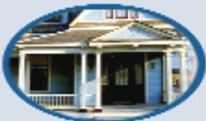
• Insulated exterior doors