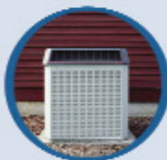
• Inspected electric heat pump