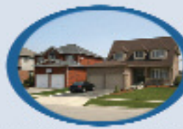
• Insulated garage doors