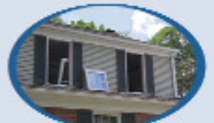
• Insulated replacement windows

For more information and loan terms, please call 793-5547