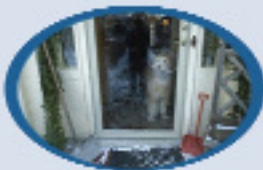
• Storm doors